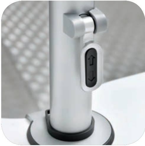
Soft touch tactile height adjustment lever.