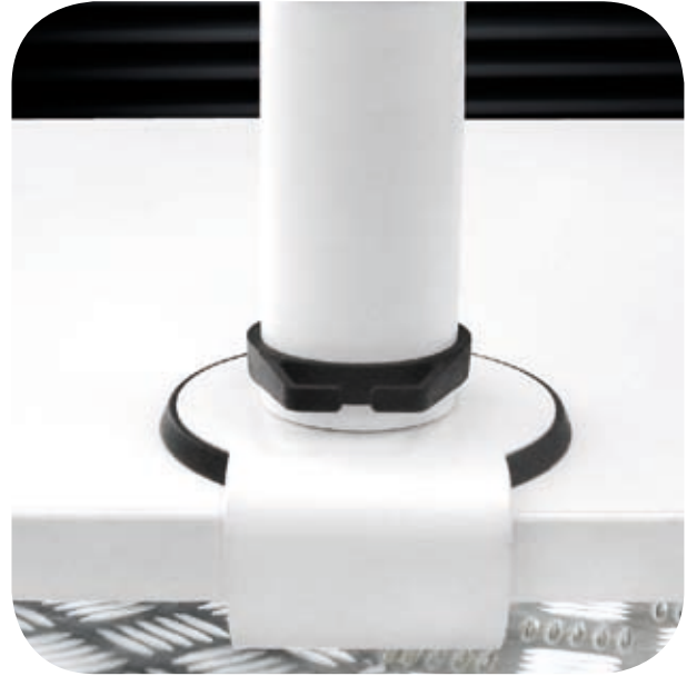
Standard desk clamp for 20mm to 30mm desktops.

Available with desk clamp, tool rail and through desk fixings. X-STREAM also offers a unique weight loading capacity enabling the user quick and easy screen interchange. Our cable management system spanning the entire arm from desk to screen provides the user with a clutter free environment.