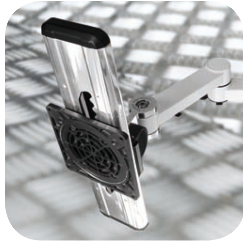
Optional height adjustable ratchet mechanism.