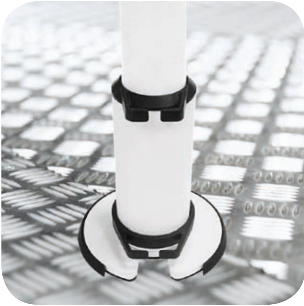
Standard through desk fixing.