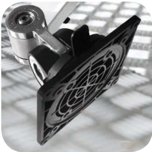
Tilt and rotate screen mount featuring a lockable quick release VESA function.