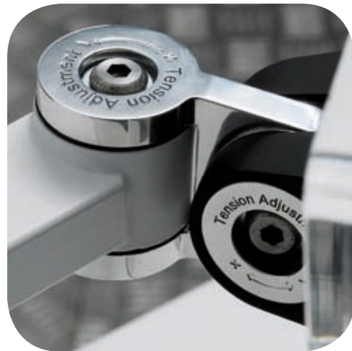
Metallic head mechanism highlighting the easy to use tension adjustment.