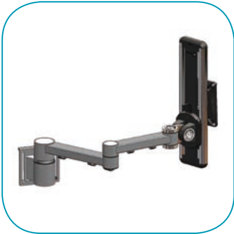
Tool rail mounted dual beam arm with front end height adjustment.

Examples of possible configurations available across the X-STREAM range.