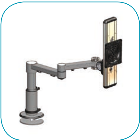
Dual beam arm with front end height adjustment with through desk fixing.