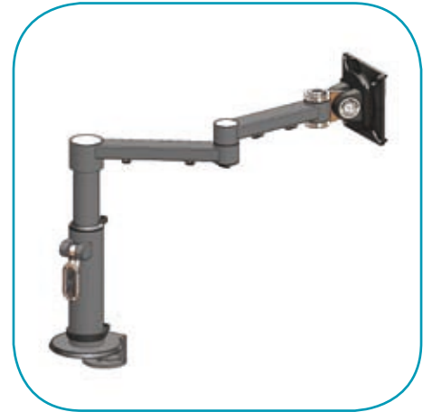
Height adjustable dual beam arm with clamp fixing.