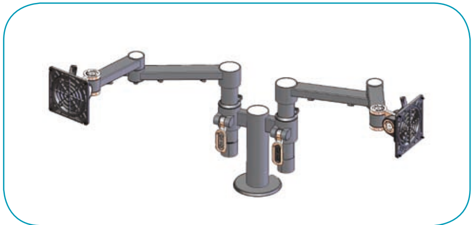
Dual screen arm with base adapter.